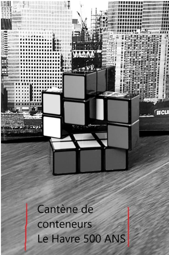
Cantène de conteneurs Le Havre 500 ANS